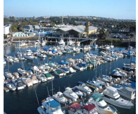
Marina view from the Skyride See page 2 for SeaWorld info

The first turn is also familiar as the entrance to the SeaWorld/Hubbs Research building. Already, we've experienced the improvement in flow, safety and direction. Remember: The fourth left turn is no longer open, but we have two new options available.