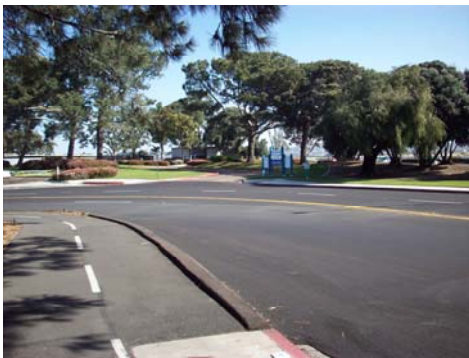
First left turn from the signal