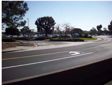
Third left turn from the signal